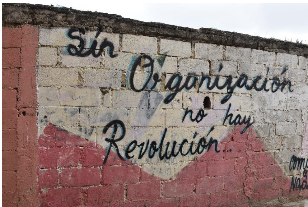
‘Without organization there is no revolution,’ painted on a wall at the Altos de Lidice Commune in Caracas